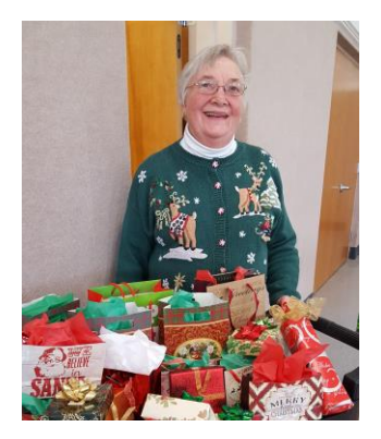
Sign up in the old Sunday School room. Need transportation? Contact Edna Harris